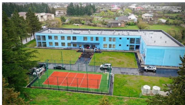
Geguti public school N1