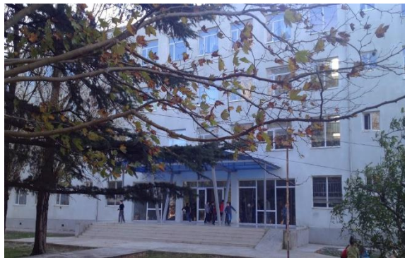
Kvitiri public school