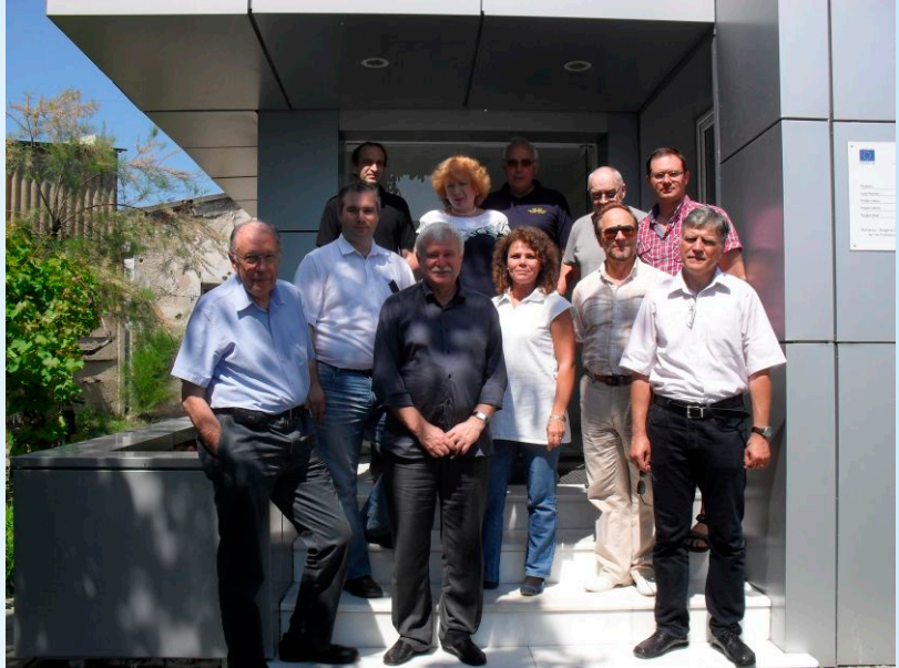
MAREAS partners in front of GeoEcoMar Branch in Constanta, on the occasion of Kick-Off meeting