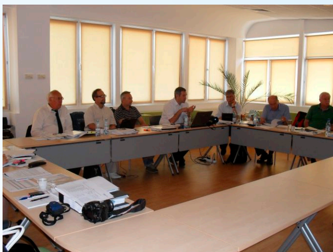
Partners during the Kick-off meeting (4 June 2012)

TUBITAK Marmara Research Center, Earth and Marine Sciences Research Institute, Kocaeli, Turkey