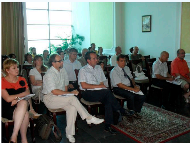
Workshop with scientists (Constanta July 2012)