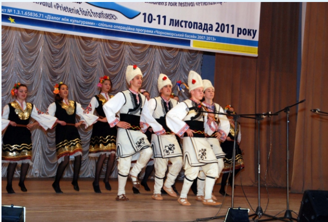
Cross-bordered children's folklore festival "Friendship without borders", Bolgrad-10.11.11. 2011

Murfatlar Local Council, South-East, Romania Bolgrad Region, Odessa, Ukraine