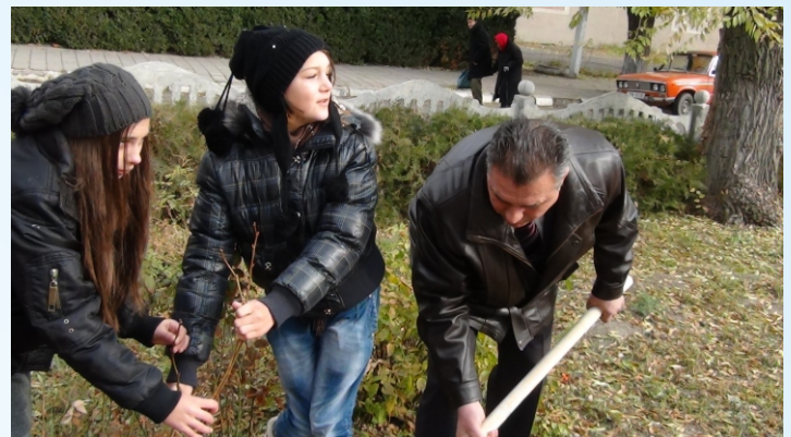
Alley of friendship "European garden" Bolgrad-11.11. 2011