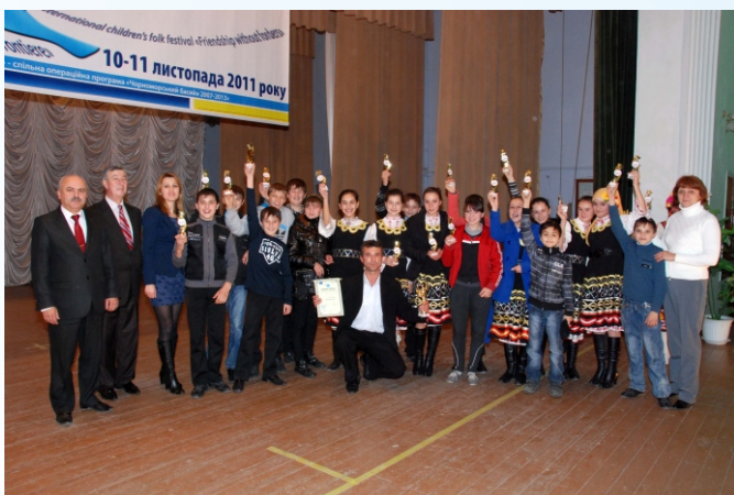
Awarding the participants