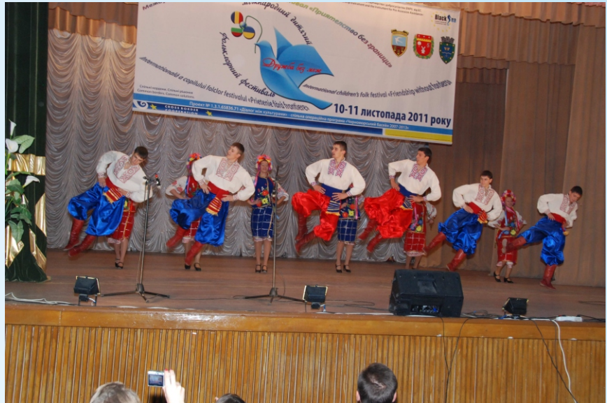
Cross-bordered children's folklore festival "Friendship without borders" Bolgrad-10-11.11. 2011

The Project seeks to establish a model of stable cooperation between young people. A Youth Volunteer Network for Cultural and Social Initiatives will be established. It will have 3 sections of volunteers /General Toshevo, Murfatlar, Bolgrad.