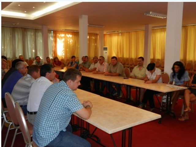
Workgroup and exchange of experience in tourism sector, Constanta, Romania