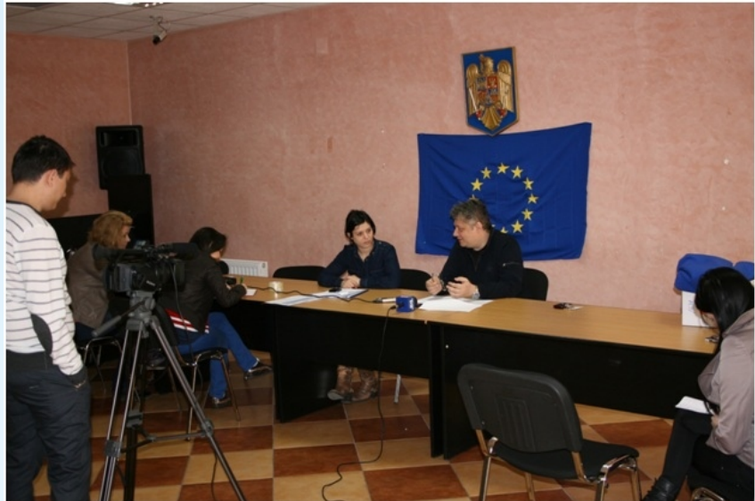
Press conference for launching the project, Constanta, Romania

The project targets common problems identified in the area of cooperation, in the field of tourism development, and the three cross-border partners designed specific solutions for overcoming these issues: joint strategic framework for supporting, in an integrated manner (“integrated conversation and exploitation” of tourism resources), tourism development in Black Sea Basin, networking for creation and promotion of common tourism products based on area’s potential trainings and exchanges of experience for improving the standards in tourism services and related activities (cross-border campaign for improving and harmonising tourism standards and services).