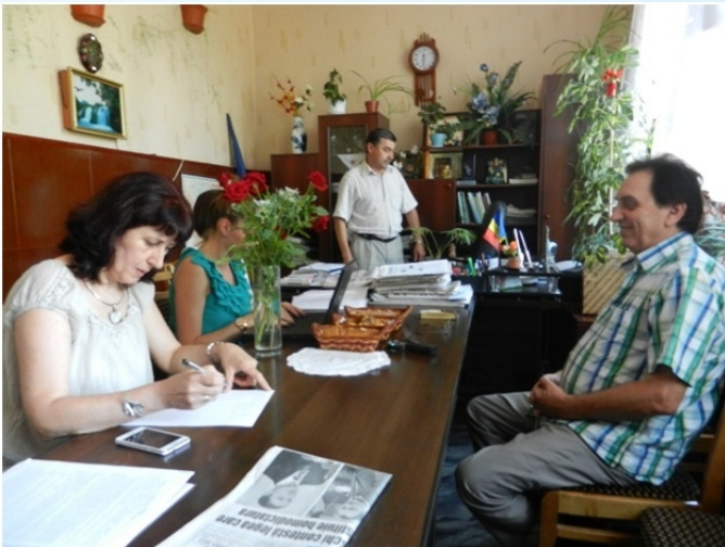
Strategy meeting of the tourism consultants, R. Moldova