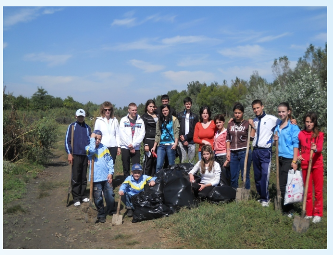
Clean up activities in the Galati county

Raising environmental education on SMW management Visibility actions