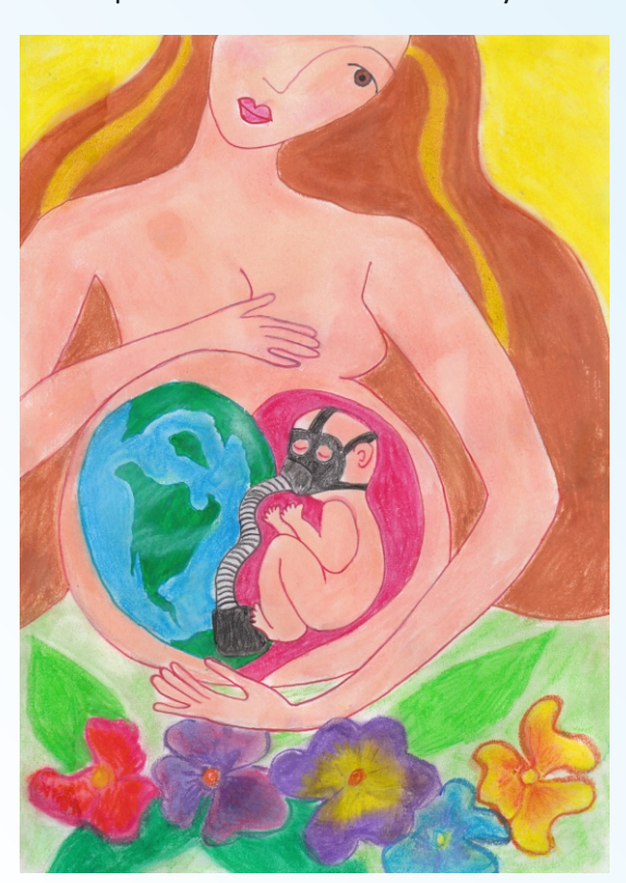
Winner of the pictures contest in Burgas District, Bulgaria