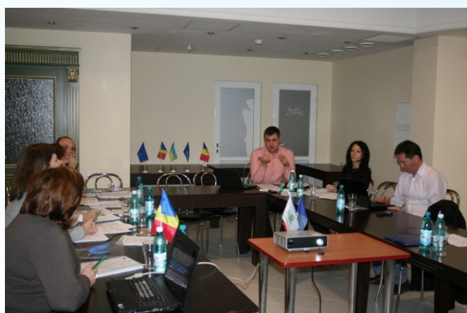
Workshop with project staff, Moldova, December 15, 2011