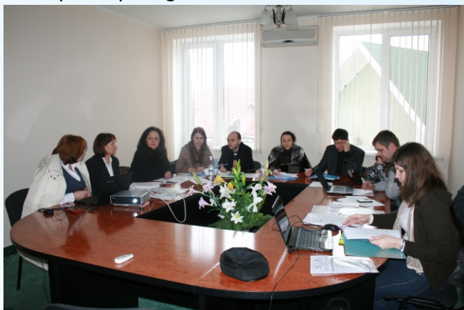
Training in the methodology of price collection, Moldova, February 29, 2012