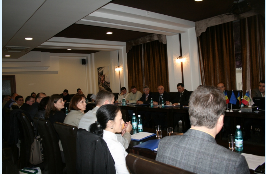
Launching Conference in Moldova, December 16, 2011

The Action aims to carry out integration activities in the Black Sea Basin, focused on increasing regional trade and boosting economic development in rural areas. Also, the Action aims to improve the quality of information by creating a regional system of information about markets in Galati and Constanta (Romania), Odessa Oblast (Ukraine) and the Republic of Moldova. This will generate an increasing level of regional economic cooperation among countries, an increase in export transactions.