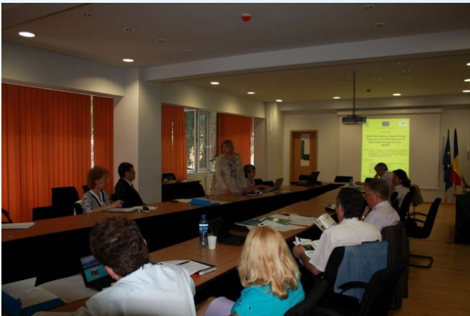
The Consortium Partners at the Kick off Meeting, July 4th, 2011