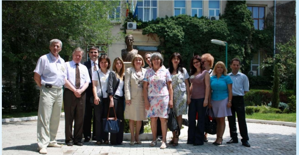
The Consortium Partners at the Kick off Meeting, Constanta, July 4th, 2011

The project proposal has been conceived in order to address the problems related to the adjustment of study programmes to the needs of the sector, to bring a contribution to the exchange of best practices through the mobility of students and teachers, to improve the cross cultural skills and attitudes of students for addressing projects with regional relevance and to generate awareness on regional issues.