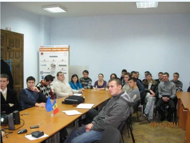
Participation of Moldovan students from „Energy and Environment” and “Electrical Engineering” Master Programs at the e-seminar on “Solar PV – practical application”, organised within ARGOS Project on December 09, 2011