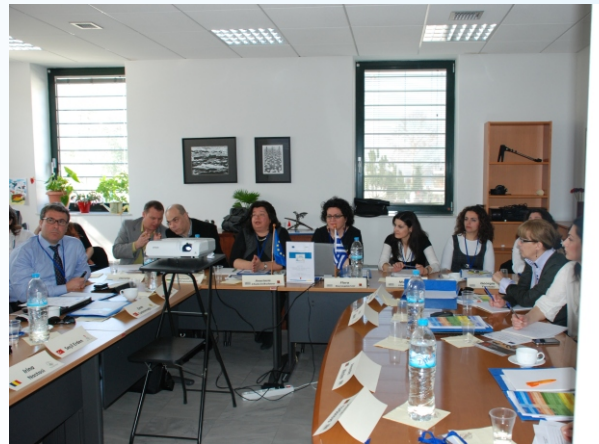
1st Steering Committee meeting (29-30/3/2012)