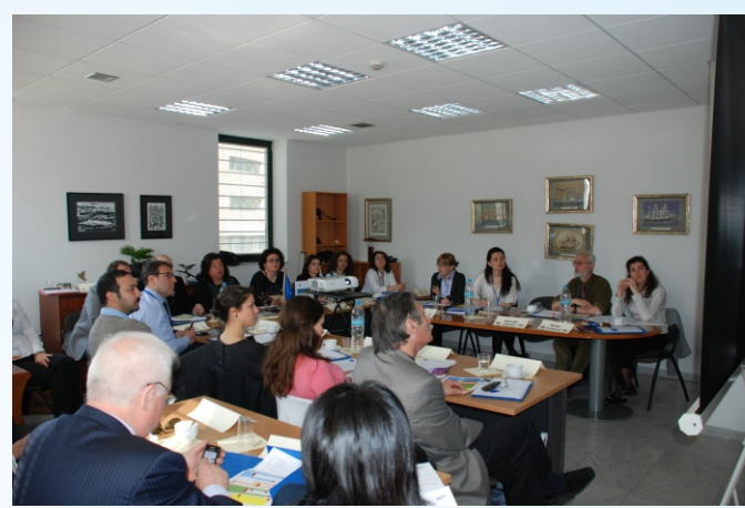
1st Steering Committee meeting (29-30/3/2012)

- Organization of an International Symposium in Thessaloniki, where findings and products of the project will be presented.