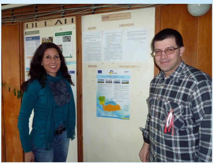
Publishing and Distribution of first Project Poster at IO-BAS (ENPI Beneficiary) –March 2012 (GA 4, Activity 3)

The project is aiming to contribute to reducing the negative impact of production, trading and consumption on natural resources that are significantly threatened by current traditional ways of development approaches, as the main need of target groups and final beneficiaries, and it is focusing on optimizing the economic development and environmental protection in the Black Sea Basin.