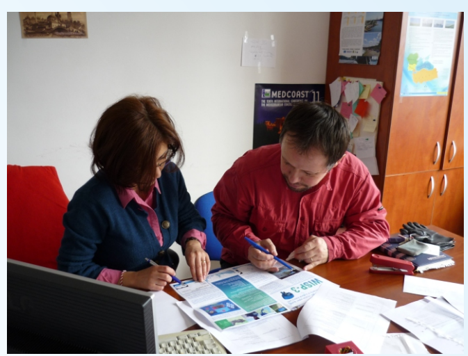
Working process with Data expert at NIMRD (ENPI Partner 1) – March 2012 (GA 2, Activity 1)