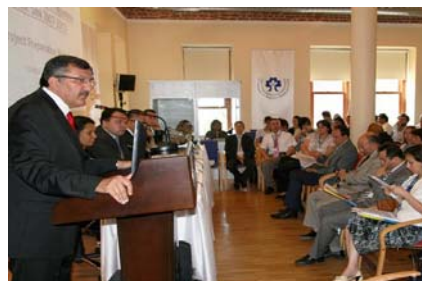
30 July 2009, Project Preparation Workshop, Istanbul

In the framework of the first call for proposals of the JOP “Black Sea 2007-2013”, the Joint Managing Authority together with the Regional Capacity Building Initiative, the National Info Points and the National Authorities from the countries participating in the Programme organized 41 events. In order to respond better to the needs of the potential beneficiaries, the events had different formats: Partner Search Forums (3), Info Days (9), Project Preparation Workshops (19), and Follow -up Information Workshops (10).