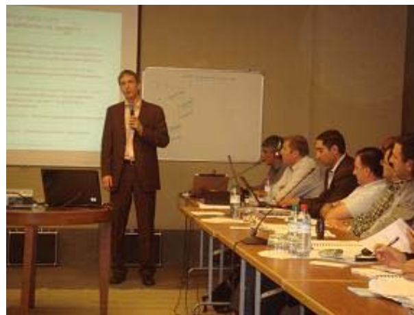
30 May 2009, Gyumri, Armenia

Supporting the Partner Countries to participate in the implementation of the Black Sea ENPI CBC programme is the EU funded Regional Capacity Building Initiative (RCBI). As well as organizing events in conjunction with the JMA and National Authorities, RCBI gives support to potential applicants and partners through a Partners database on its website and making all info and training material available for download.