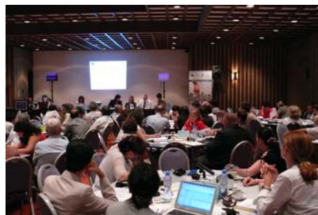
23 July 2009, Partnership Forum in Varna

The successful kick off Conference of the Programme organized in Bucharest on 5 th of May was followed by the launching of the 1 st call for proposals on the 30 of June with deadline for submitting the proposals on the 12 October. The indicative amount of ENPI funds allocated under this first call was 3.311.369 EURO, and Turkey participated with IPA funds amount to 1.339.401 EURO. The co-financing of the EU is 90 % of the total eligible costs at project level. The cross-border cooperation projects, financed within this call, cover the areas of sustainable economic development, tourism, nature and environment protection and cultural cooperation, areas that correspond to the three priorities of the Programme.