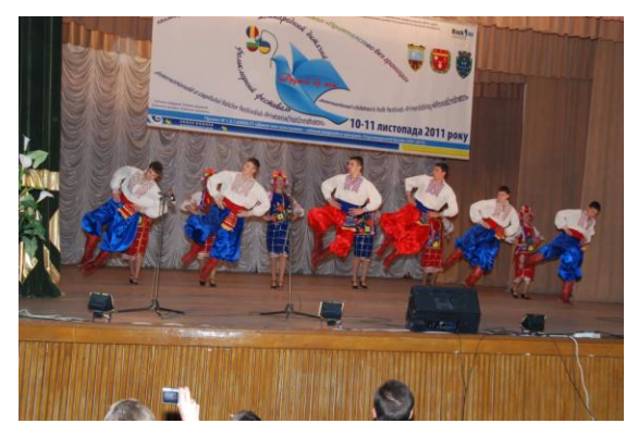
Cross-border children's folklore festival "Friendship without borders" in Bolgrad, organised within the Project "Dialogue between Cultures" financed by the Programme.