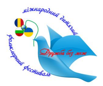
Logo of the Project "Dialogue between Cultures"