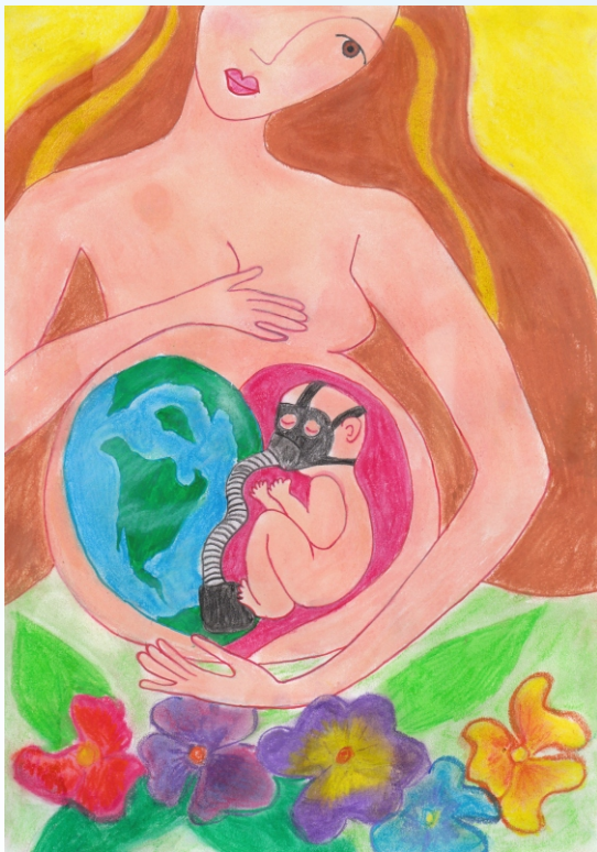
Winner of the pictures contest in Burgas District, Bulgaria