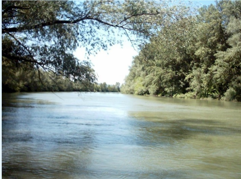
Prut River - Prut river valley is one of the biggest target region of the project

The project deals with the public awareness on solid municipal waste management. It is planned to work closely with the representatives from the local public administrations, educational institutions, farmers in order to promote the separate collection of solid municipal waste. It is planned to build small demonstration platforms for composting the vegetal waste, publishing the information and educational materials on separate collection of solid municipal waste, etc. Two conferences will be organized with participants from 4 countries.