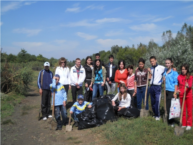
Clean up activities in the Galati county

Strengthening capacities of the local public administration in the field of solid municipal waste management Raising environmental education on SMW management Visibility actions