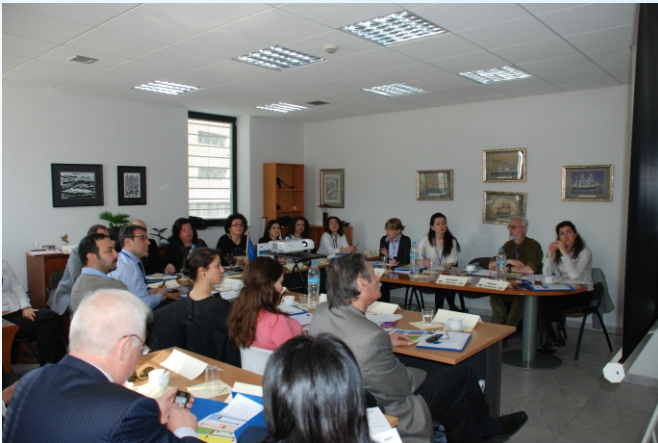
1st Steering Committee meeting (29-30/3/2012)