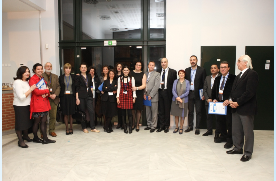
Official Opening. The Partners (28/3/2012)