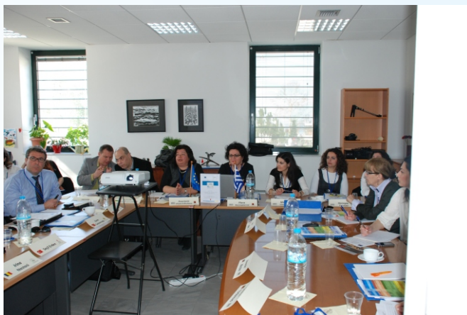
1st Steering Committee meeting (29-30/3/2012)