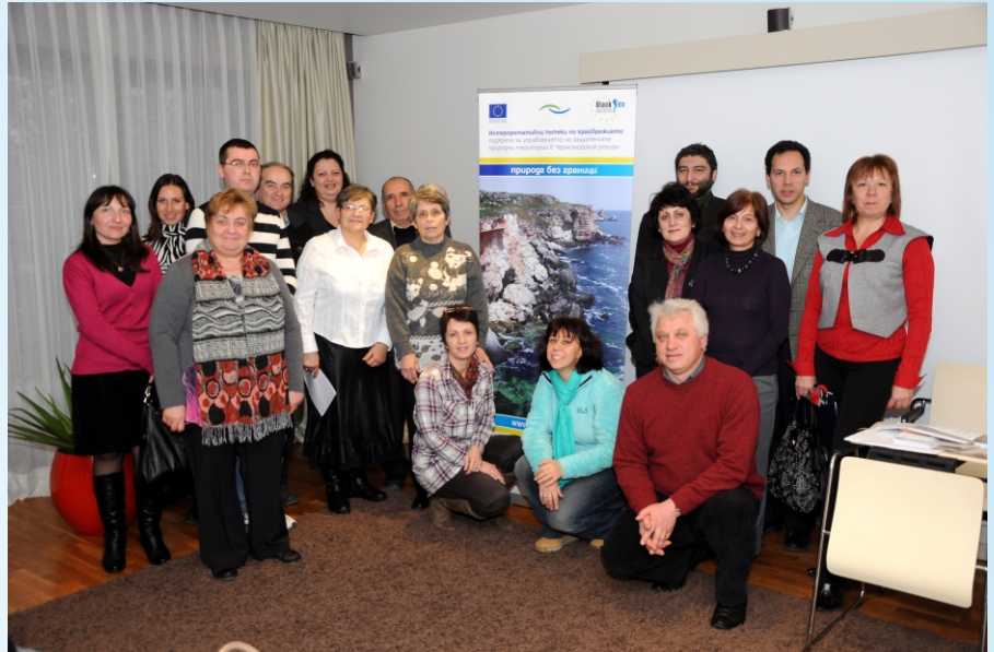
Meeting of the Bulgarian National Team, Varna, 12 January 2012

The Action will provide support to the establishment of national and cross-border expert structures for interpretation of nature and cultural diversity in nature protected areas and for the training of experts in modern environmental management practices. A substantial part of the common efforts is the elaboration of the trails with production of guide books for the trails and the training of nature interpreters, as well as the production of visibility and awareness interpretative media. The project outcome will be presented during a final cross-border conference on interpretation in the Black Sea region.