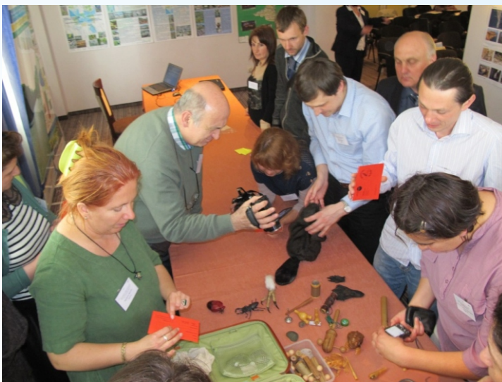
Regional workshop "How to Interpret Black Sea Nature", Varna, 20-22 April 2012. Use of props in nature interpretation