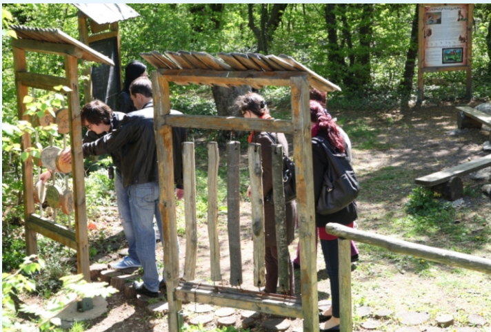
Field trip to an interpretative trail in Shumen Plateau Nature Park during the first regional workshop, 22 April 2012