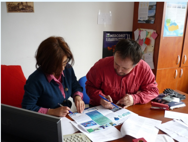
Working process with Data expert at NIMRD (ENPI Partner 1) – March 2012 (GA 2, Activity 1)