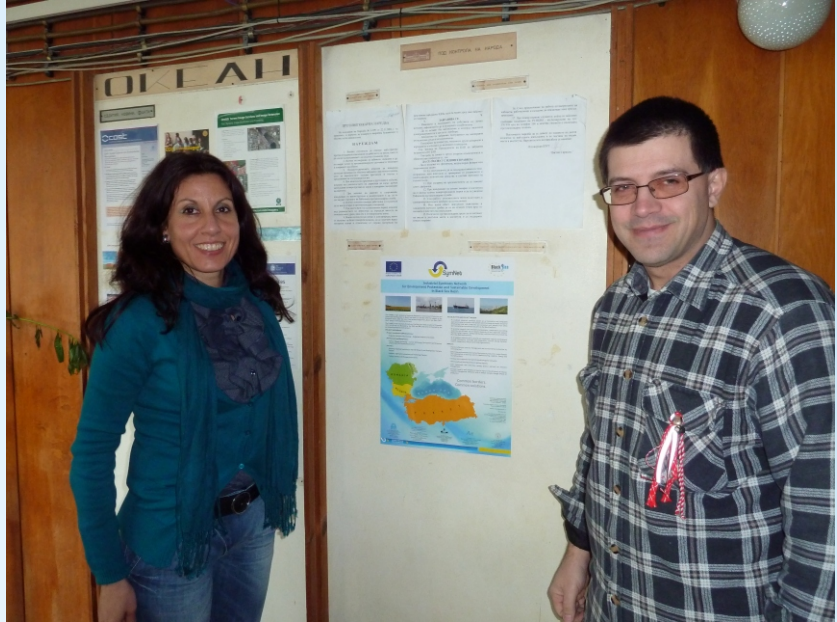
Publishing and Distribution of first Project Poster at IO-BAS (ENPI Beneficiary) –March 2012 (GA 4, Activity 3)

The project is aiming to contribute to reducing the negative impact of production, trading and consumption on natural resources that are significantly threatened by current traditional ways of development approaches, as the main need of target groups and final beneficiaries, and it is focusing on optimizing the economic development and environmental protection in the Black Sea Basin.